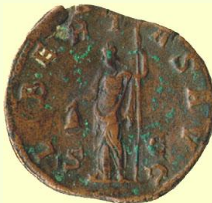
Goddess Libertas of Rome on Coin circa 200 B.C.