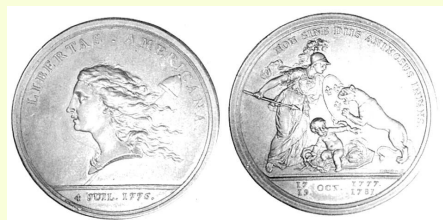
Goddess Libertas of America on Coin